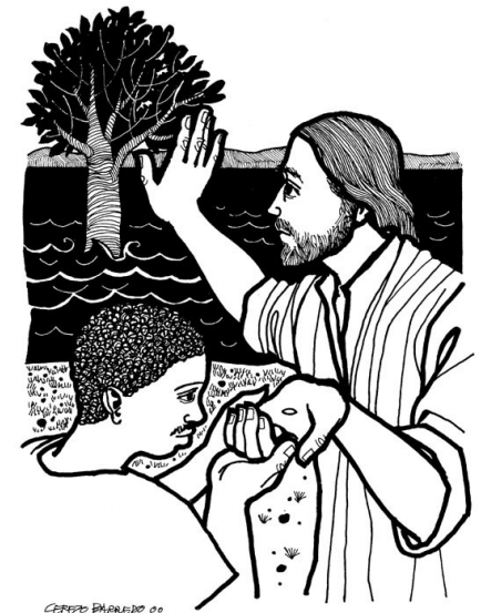
CEFERO PHARISIO 00

Don't worry.... Have FAITH! And wonderful friends!